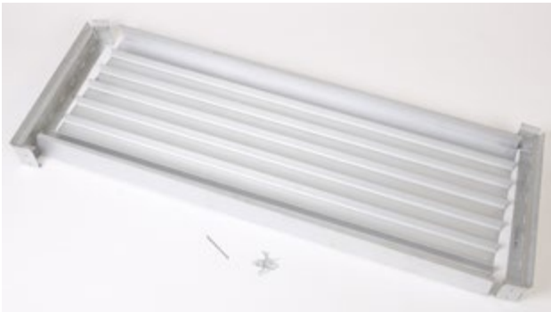
1. Tray and Parts