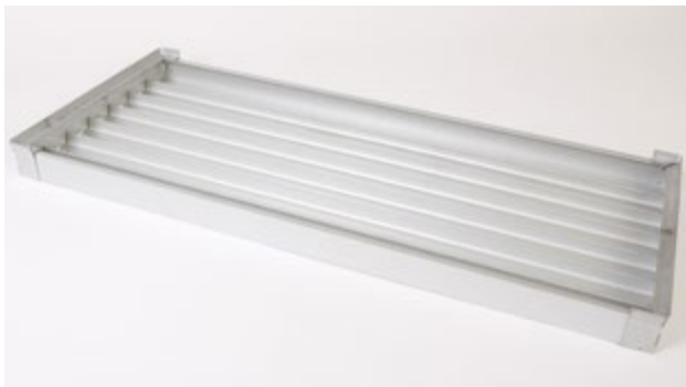
4. Ready to use

ASSEMBLY: Supplied in kit form with a drill bit and rivets, the prefabricated end pieces are assembled using a Drill and Rivet Gun. STURDY: U-Build-It Trays are made from high quality Aluzinc. SIZE: U-Build-It Trays are available in a wide range of sizes. Please note: Drill and Rivet Gun not supplied.