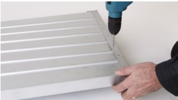
2. Drill rivet holes

Designed for export, U-Build-It Core Trays save space. Once assembled, U-Build-It Core Trays may be easily stacked without the need for racking. They also save space when transporting on pallets and in containers. Also available as non-stackable.