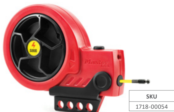
Cable Lockout Nylon Retractable 2740 x 3.3mm