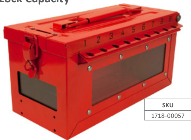
Box Group Lockout With Window 30 Lock Capacity