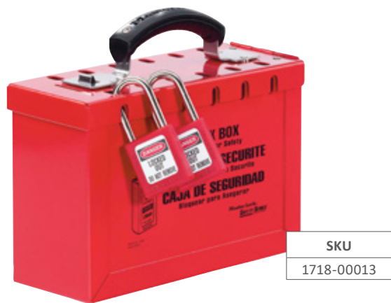
Lockbox Portable Group Box 498A Red