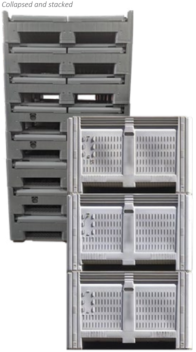
Upright and stacked