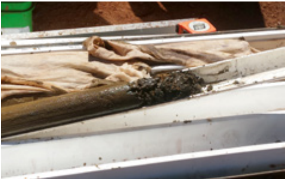
PVC split being used to transfer wet core sample into plastic core tray

Westernex PVC splits are used to keep core samples in one piece and prevent the contamination or loss of samples. They are ideal for samples that are broken or wet and can be extracted directly onto splits from the drill tube and, subsequently, into core trays. These PVC splits are made in our own facility and so custom sizes can be requested.