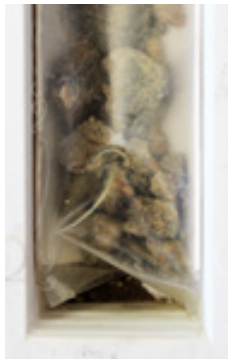
PVC split in heat-sealed layflat tube in plastic core tray