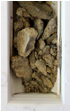
PVC split in plastic core tray