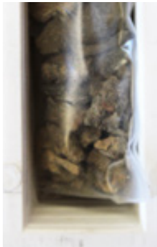
Heat-sealed layflat tube in plastic core tray